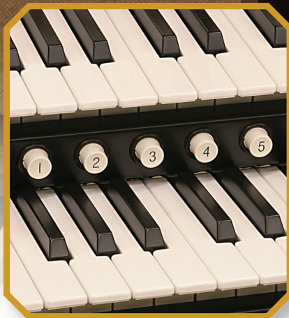
INDUSTRY STANDARD VELOCITY-SENSITIVE KEYBEDS