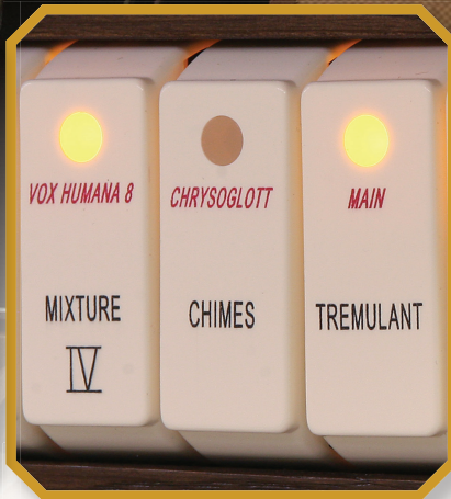
LED STOP CONTROLS